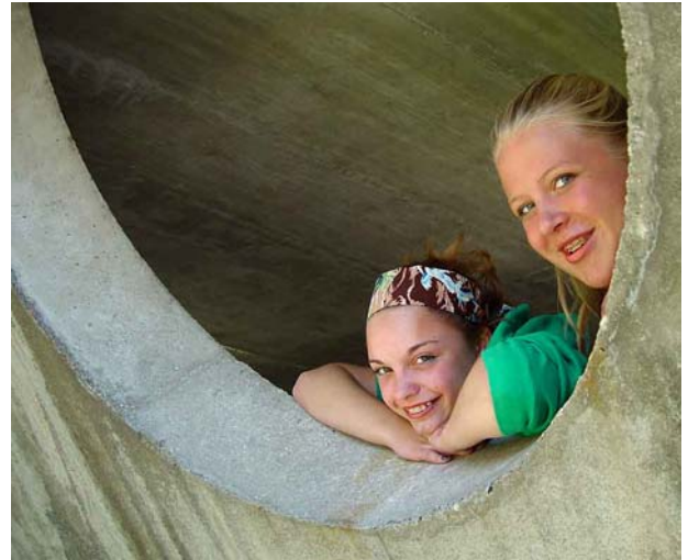
4. Frame your subject