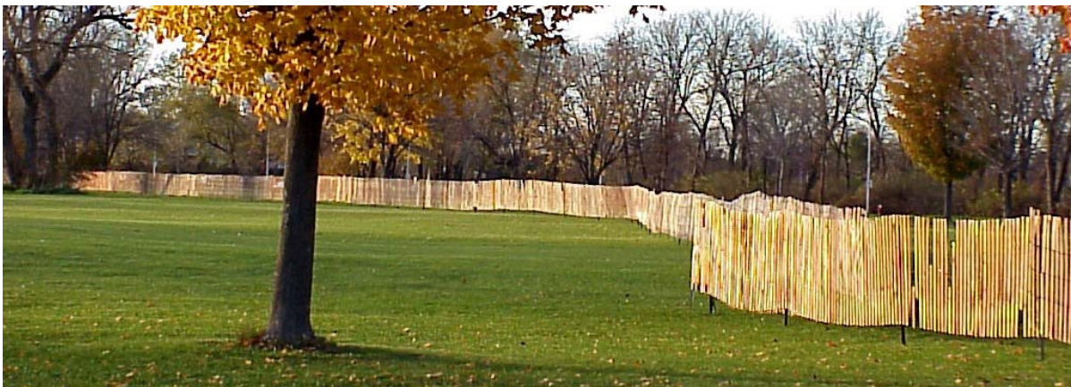
5. Use lines to lead eye into photo