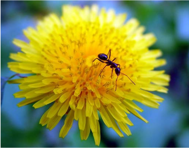
1. Get close