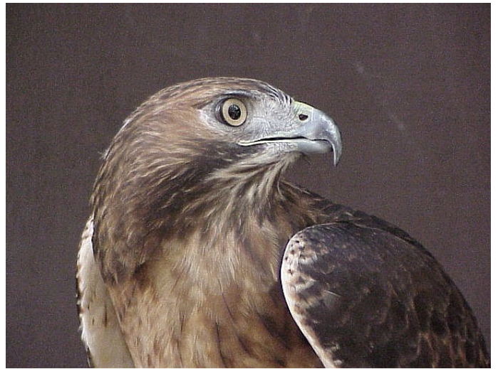
2. Take subject against simple background